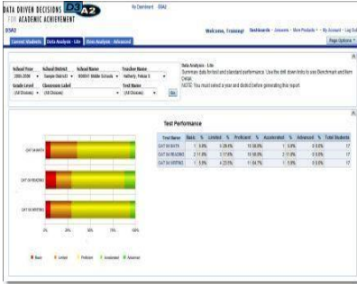
Data Analysis-Lite Tab

on the Current Students tab, teachers explore their current students' strengths and weaknesses, through analysis of their previous test results on the Ohio Achievement and Graduation Tests. Class lists are automatically re-rostered to reflect current student and teacher course assignments by uploading district data to the Data Warehouse