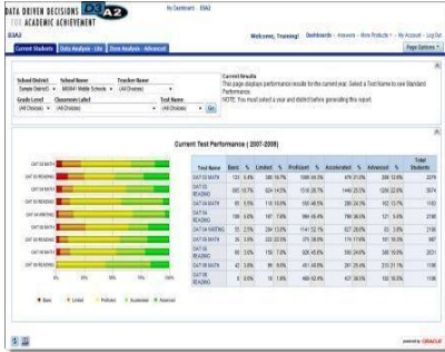
Current Students Tab

There are multiple methods of accessing reports within D3A2: